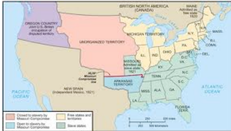
THE MISSOURI COMPROMISE, 1820-1821